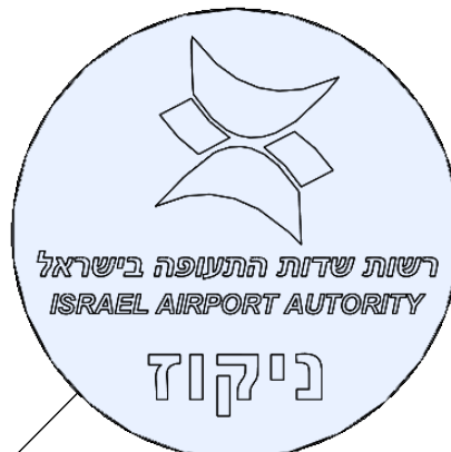
DETAIL A SCALE 1 : 3